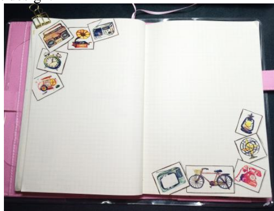
Figure 1 Layout design to enhance the beauty of white space

Layout design occupies a very important position in the field of media communication, which can bring the audience intuitive feeling, affect the effect of information dissemination, the expression form of layout design is relatively unique, good layout design can be easy for people to understand and accept, and get the favor of the audience. Under the current situation, the art of white space is a very key form of artistic expression, which is the main method to embody the traditional art in our country, and can show the artistic characteristics in the traditional aesthetics with the maximum limit. The use of white space in layout design, on the one hand, can enhance the beauty of design, with the help of different methods to reflect the uniqueness of typography, on the other hand, the application of white space can also enhance the innovation of layout design, meet the new standards and requirements of the times for layout design, help to promote the smooth and rapid development of layout design.